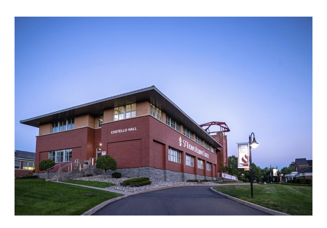
2024 Annual Security & & Fire Safety Report